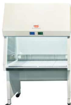
HMC Safeguard Pro 1200 The classic size

Perfect for challenging tasks in the smallest spaces